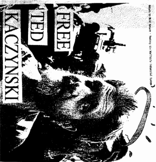
Source: This handout was selectively distributed at the 1997 Earth First! rendezvous, showing that the Unabomber enjoys some sympathy among radical environmentalists.